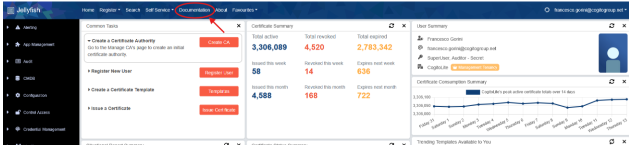
Figure 1 - Link to documentation in the Jellyfish Portal

To access the API documentation for a specific environment, simply login to that jellyfish instance and click the Documentation link in the navigation bar.