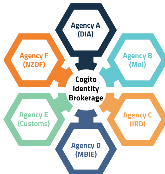
Figure 2: Workflow of Cogito Identity Brokerage Solution

Cogito Group's Identity Brokerage solution enables the use of shared network services without the need to establish "trusts" between building tenants. Cogito Group's Identity Brokerage enables ONE connection per agency (not 300). This gives agencies seamless, secure access but importantly ensures they are in control of who has access within their network.